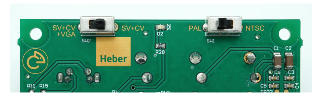
Right hand switch selects PAL or NTSC output