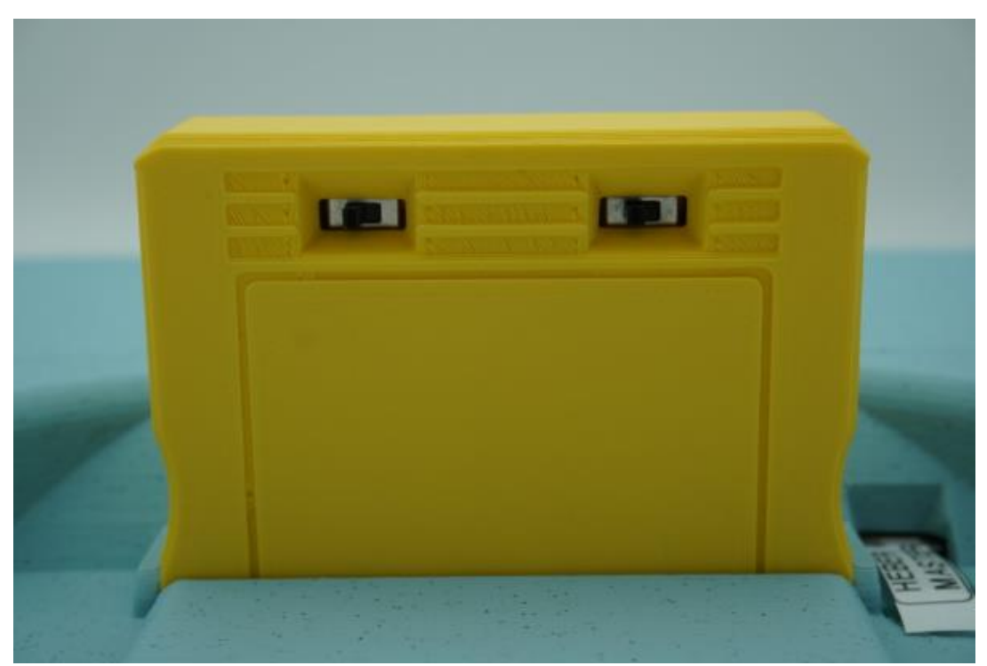
Left hand switch is the VGA/SCART