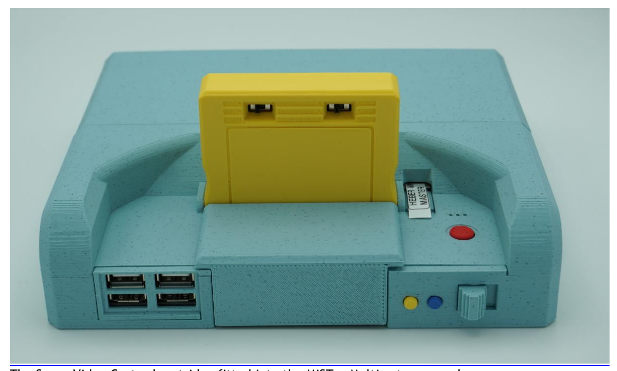
The Super Video Custard cartridge fitted into the MiSTer Multisystem console.

For orders and updates please see www.rmcretro.store